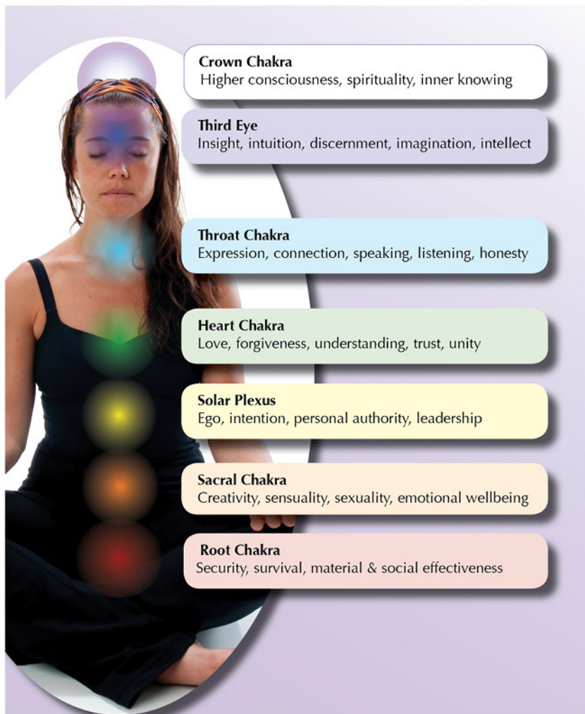
Overview of Seven Major Chakras