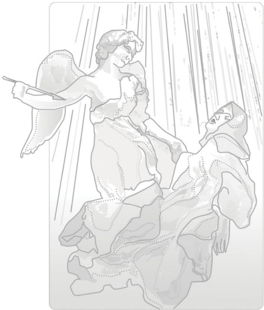
The Ecstasy of St. Teresa